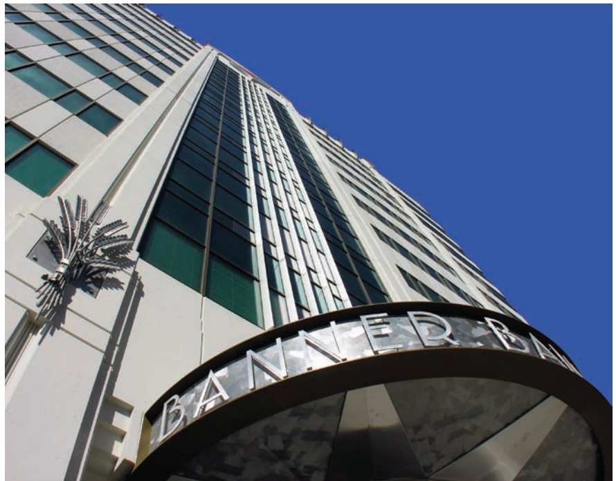
Alpha Image Photography by Giuseppe Saitta, Courtesy of HDR Architecture

With the new control contractor in place, the first step was to make a careful evaluation of the installed system. Once information was acquired from construction documents and the actual system, the new control contractor sat down with the owner to determine what the issues were and possible resolution to the problems. Additionally, the new contractor reviewed the original specifications, drawings and