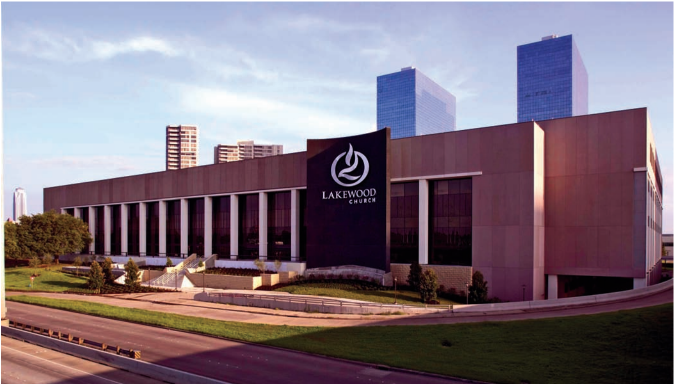
Houston's Lakewood Church is the largest in the U.S. A BACnet-based HVAC system keeps 16,000 worshippers cool in the sanctuary.

The following article was published in ASHRAE Journal, November 2007. ©Copyright 2007 American Society of Heating, Refrigerating and Air-Conditioning Engineers, Inc. It is presented for educational purposes only. This article may not be copied and/or distributed electronically or in paper form without permission of ASHRAE.